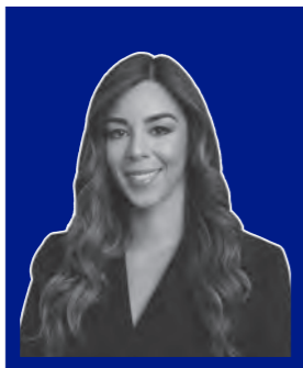
State Senator Natalie Toro